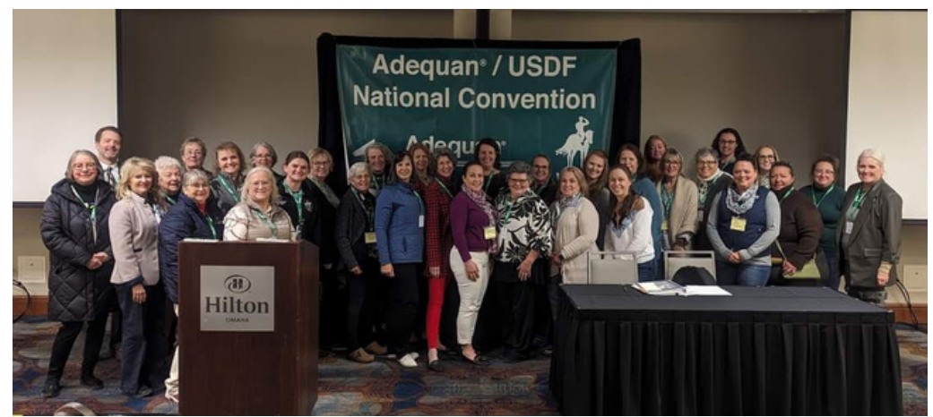
Region 2 meeting at the 2023 USDF Convention, Omaha, two CLD'ers in the front row.

At my first convention, I immediately noticed how USDF utilizes committees to get things done. Committees accomplish specific tasks, and the Committee Chair brings that information to the Executive Board. The board does not try to do everything; they know that they can't. This is perhaps the most important thing that I brought back from my first convention. I am attempting to implement this in our club.